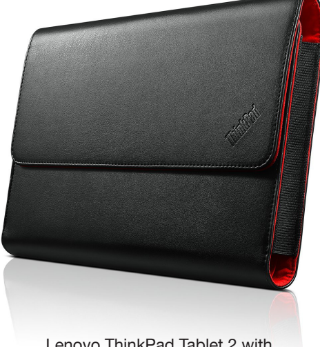
Lenovo ThinkPad Tablet 2 with ThinkPad Tablet 2 Fitted Sleeve 0A33902

Lenovo ThinkPad Tablet 2 with ThinkPad Tablet 2 VGA Adapter 0B47084