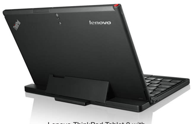
Lenovo ThinkPad Tablet 2 with ThinkPad Tablet 2 Bluetooth Keyboard with Stand 0B47270

Lenovo ThinkPad Tablet 2 with ThinkPad Tablet 2 Fitted Sleeve 0A33902