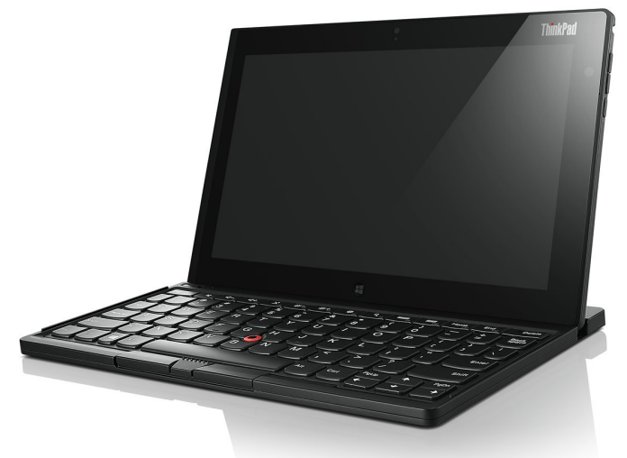
Lenovo<sup>®</sup> ThinkPad Tablet 2 with ThinkPad Tablet 2 Bluetooth Keyboard with Stand 0B47270