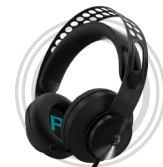
Lenovo Legion H300 Gaming Headset

* Example of Lenovo Legion catalogue naming convention