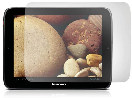
IdeaTab S2109 Screen Protector (coming soon)