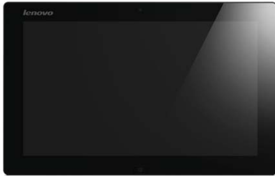
IdeaTab Lynx K3011 (Front)