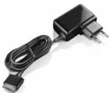
IdeaPad Tablet K1 18W AC Adapter (78Y7365)