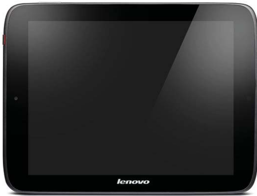
IdeaTab S2109 (Front)