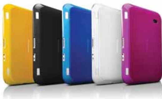
IdeaPad Tablet K1 Cover