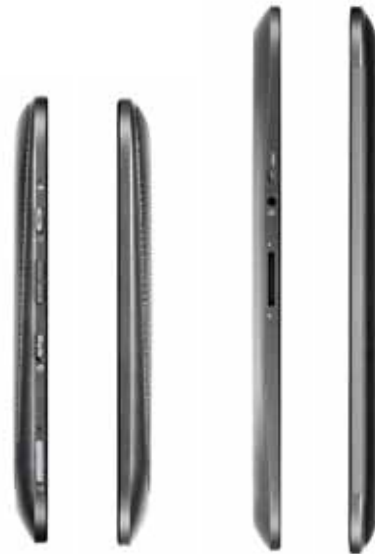
IdeaPad Tablet K1 Black (leather like)