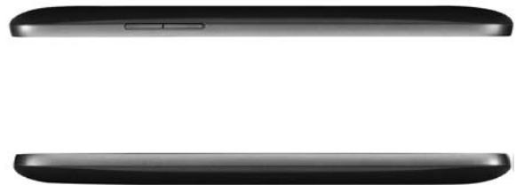
IdeaTab A2107 (Left and Right)