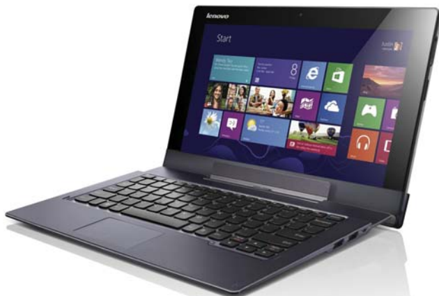
IdeaTab Lynx K3011 with optional keyboard dock (coming soon)