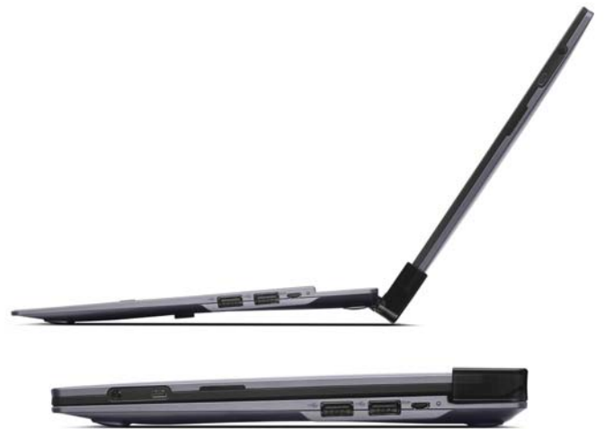
IdeaTab Lynx K3011 with optional keyboard dock (coming soon)