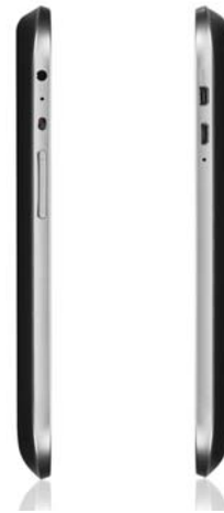
IdeaTab A2109 (Left and Right)