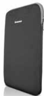
IdeaPad Tablet K1 Sleeve (57Y6750)