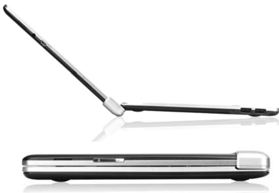
IdeaTab S2110 with optional keyboard dock