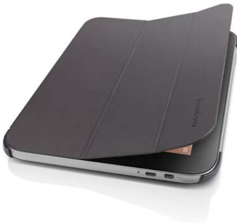
IdeaTab A2109 Folio Cover (coming soon)