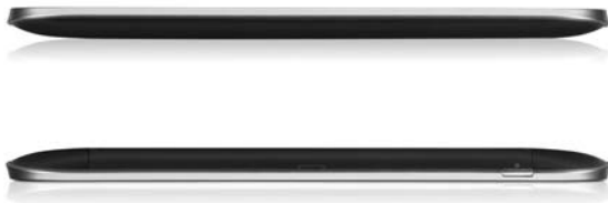
IdeaTab A2109 (Top and Bottom)