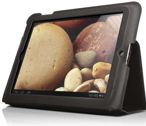
IdeaTab S2109 Folio Case (coming soon)