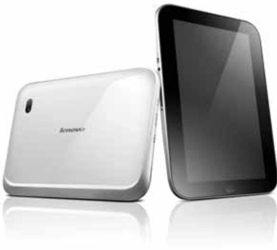
IdeaPad Tablet K1 White (high glossy)