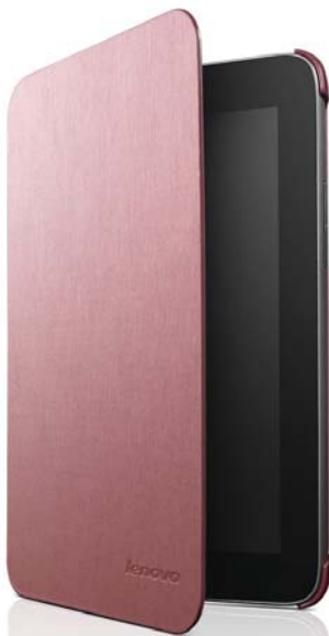
IdeaTab A2107 Case (coming soon)