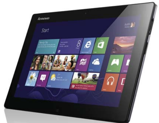
IdeaTab Lynx K3011