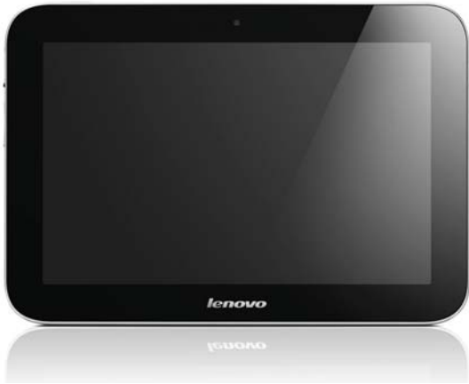
IdeaTab A2109 (Front)