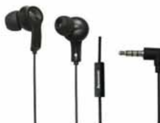
Lenovo Headset P180 (57Y6747)