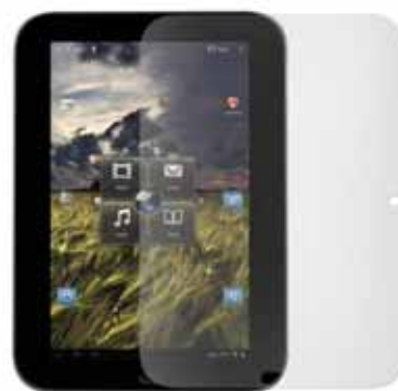
IdeaPad Tablet K1 Film (Mist Transparency) - 78Y7322 IdeaPad Tablet K1 Film (High Transparency) - 78Y7323