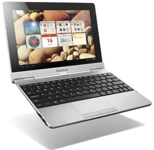
IdeaTab S2110 with optional keyboard dock