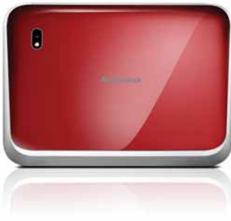
IdeaPad Tablet K1 Red (high glossy)