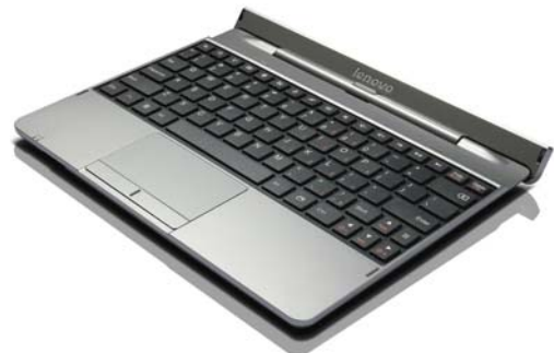
Optional keyboard dock