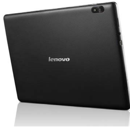
IdeaTab S2110 (Back)