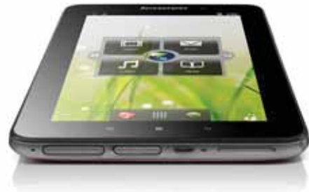
IdeaPad Tablet A1 SIM card slot only on WWAN models