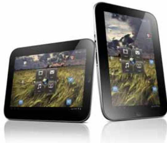
IdeaPad Tablet K1