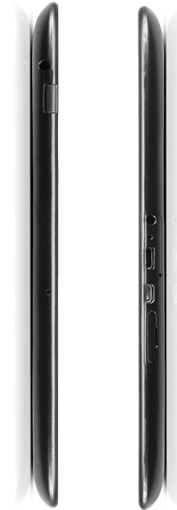
IdeaTab S2109 (Left and Right)