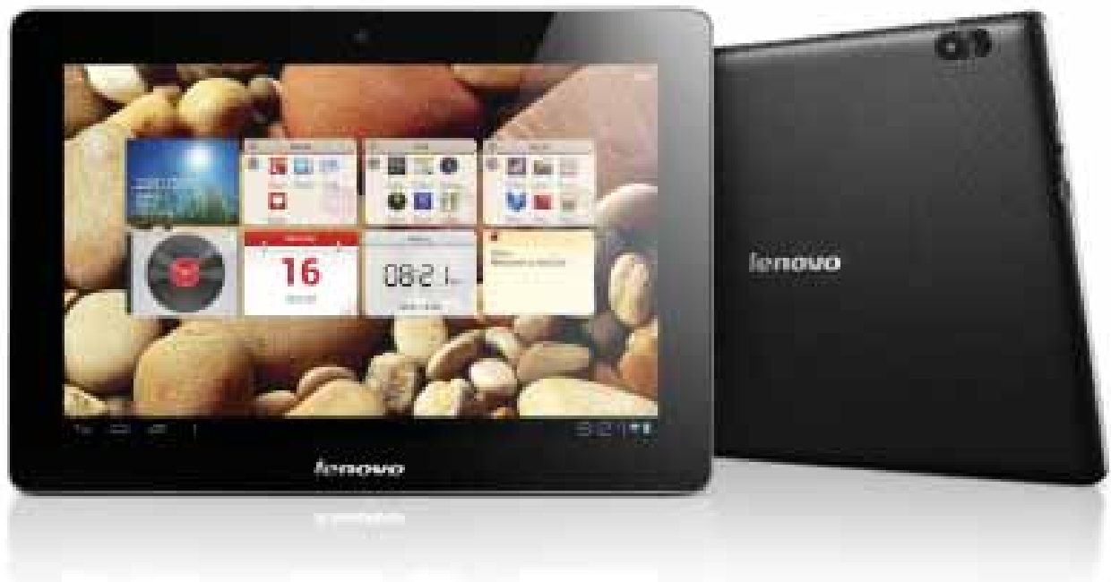
Lenovo IdeaTab S2110

Visit www.lenovo.com/psref for the latest version