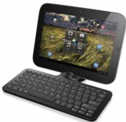
IdeaPad Tablet K1 Keyboard Dock (78Y7333)