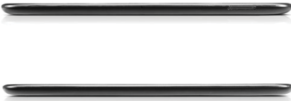
IdeaTab S2109 (Top and Bottom)