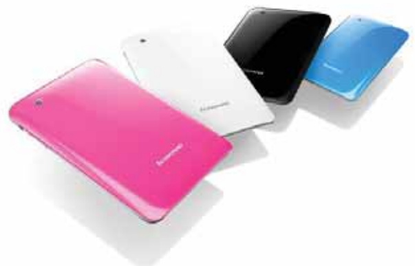
IdeaPad Tablet A1