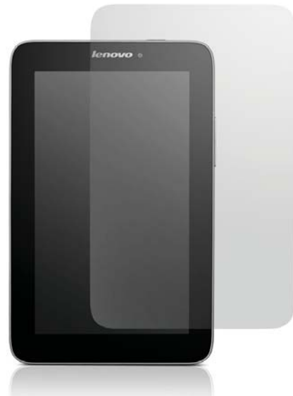
IdeaTab A2107 Screenguard (coming soon)