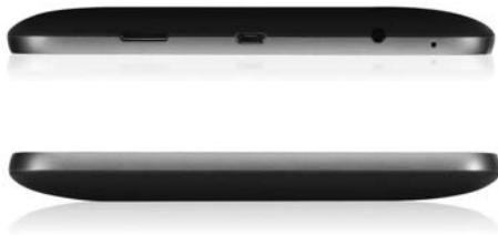
IdeaTab A2107 (Top and Bottom)