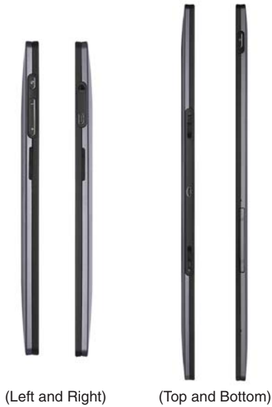
(Left and Right) (Top and Bottom)