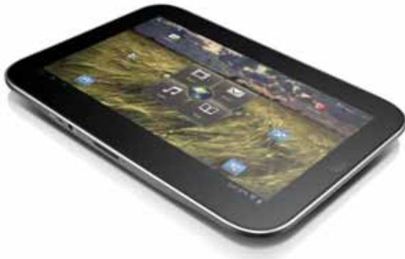
IdeaPad Tablet K1