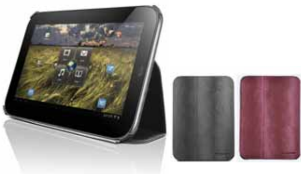
IdeaPad Tablet K1 Case (Black) - 78Y7390 IdeaPad Tablet K1 Case (Red) - 78Y7391