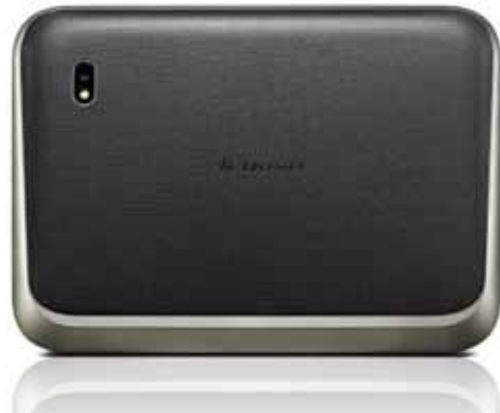
IdeaPad Tablet K1 Black (leather like)