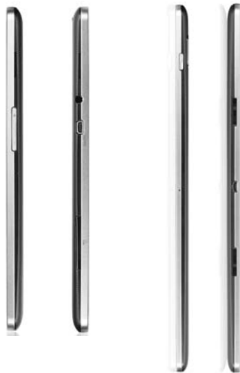
(Left and Right) (Top and Bottom)