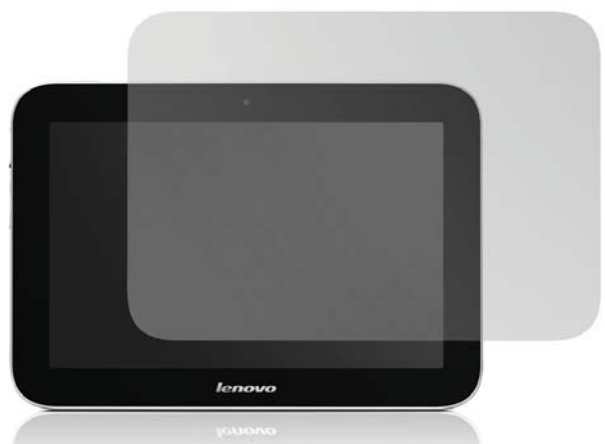
IdeaTab A2109 Screen Protector (coming soon)