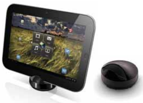
IdeaPad Tablet K1 Charger Dock (78Y7330)