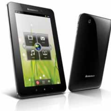
IdeaPad Tablet A1 Black