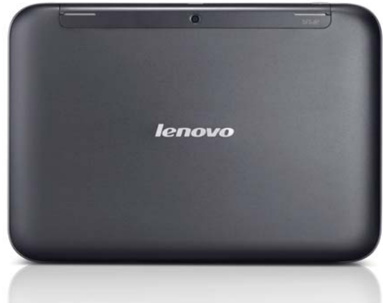
IdeaTab A2109 (Back)