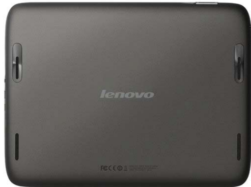
IdeaTab S2109 (Back)