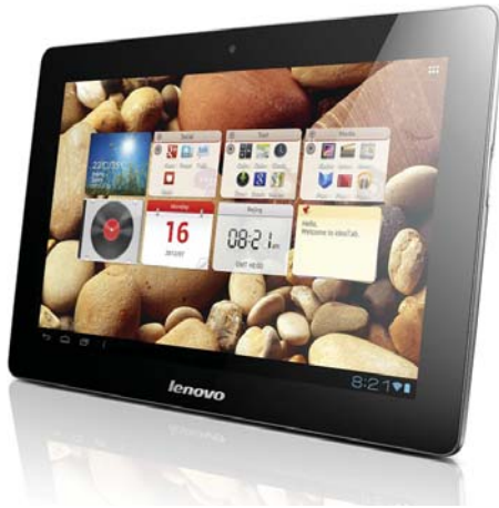
IdeaTab S2110 (Front)