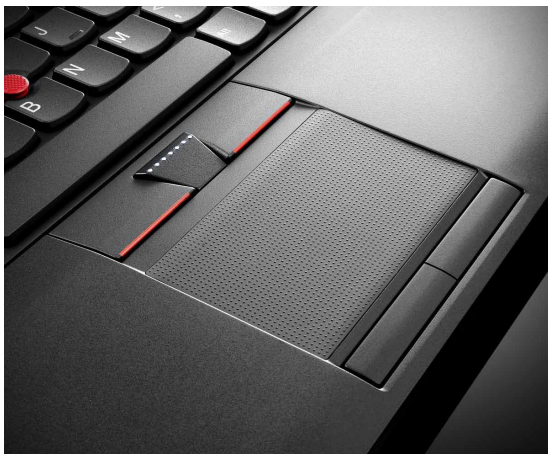
Lenovo ThinkPad L430