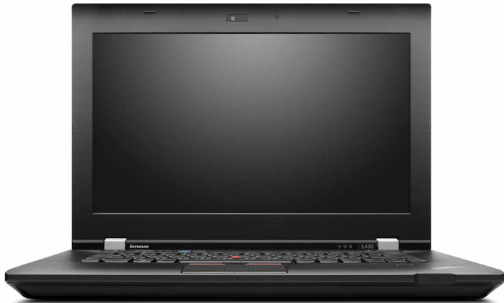
Lenovo® ThinkPad L430