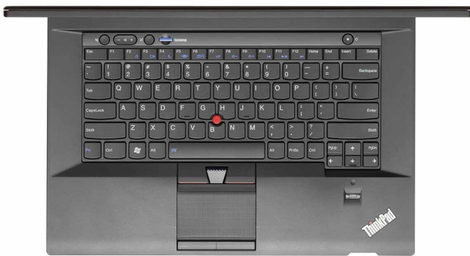
Lenovo ThinkPad L430