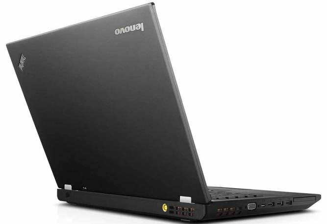
Lenovo ThinkPad L430