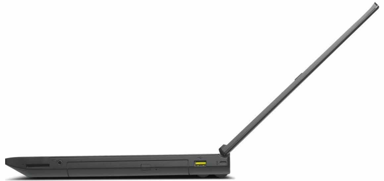
Lenovo ThinkPad L430