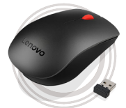
Lenovo 510 Wireless Mouse