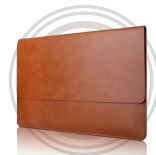
Lenovo 13" Laptop Leather Sleeve