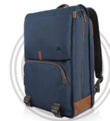
Lenovo 15.6" Laptop Urban Backpack