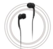
Lenovo 100 In-Ear Headphone