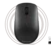
Lenovo 400 Wireless Mouse