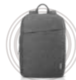
Lenovo 15.6" Laptop Casual Backpack B210