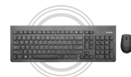
Lenovo 500 Wireless Combo Keyboard & Mouse