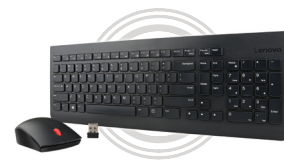
Lenovo 510 Wireless Combo Keyboard & Mouse