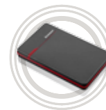
F310S USB 3.0 External Backup Hard Drive

* Example of Lenovo IdeaCentre AIO catalogue naming convention