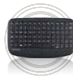
Lenovo 500 Multimedia Controller