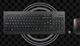
Lenovo 510 Wireless Combo Keyboard & Mouse

* Example of Lenovo IdeaCentre AIO catalogue naming convention