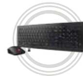
Lenovo 510 Wireless Combo Keyboard & Mouse

* Example of Lenovo IdeaCentre AIO catalogue naming convention