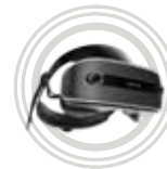
Lenovo Explorer Immersive Headset