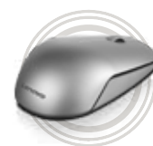
Lenovo 500 Wireless Mouse (Silver)