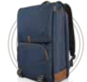
Lenovo 15.6" Laptop Urban Backpack B810

* Example of Yoga Chromebook catalogue naming convention