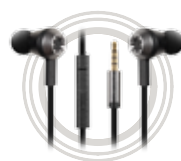
Lenovo 500 Extra-bass In-ear Headphone