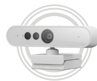
Lenovo 510 FHD Webcam