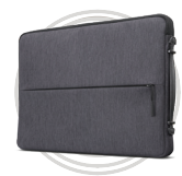
Lenovo Urban Sleeve Case