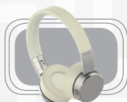
Lenovo Yoga Active Noise-cancellation Headphones