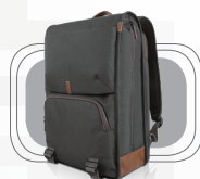
Lenovo 15.6" Laptop Urban Backpack B810

* Example of Lenovo Yoga catalogue naming convention