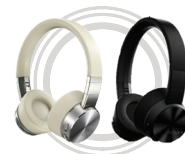
Lenovo Yoga Active Noise Cancellation Headphones