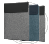
Lenovo Yoga Sleeve