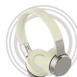
Active Noise-cancellation Headphones