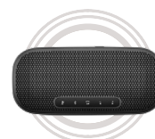
Ultraportable Bluetooth® Speaker

* Example of Lenovo Yoga Duet catalogue naming convention