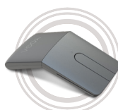
Lenovo Yoga Mouse with Laser Presenter