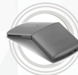
Lenovo Yoga Mouse with Laser Presenter