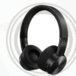
Lenovo Yoga ANC Headphone