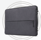
Lenovo 13-inch Laptop Urban Sleeve Case