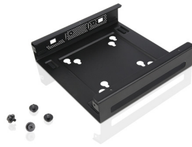
ThinkCentre Tiny VESA Mount II