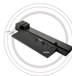
ThinkPad® Workstation Dock