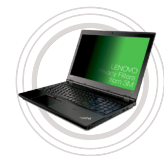
Lenovo™ Privacy Filters from 3M™