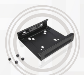
ThinkCentre Tiny VESA Mount II