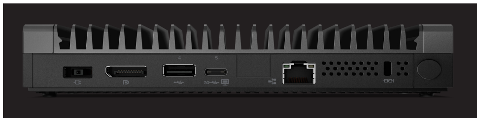
ThinkCentre M75n IoT Thin Client

We continually strive for perfection in what was already near perfect, like creating super thin devices with maximum mounting flexibility. For this, we employed laser drilling to achieve an even smaller printed circuit board assembly and created a tailored cooling system for the extreme narrow space.