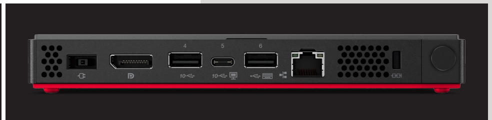
ThinkCentre M75n Thin Client