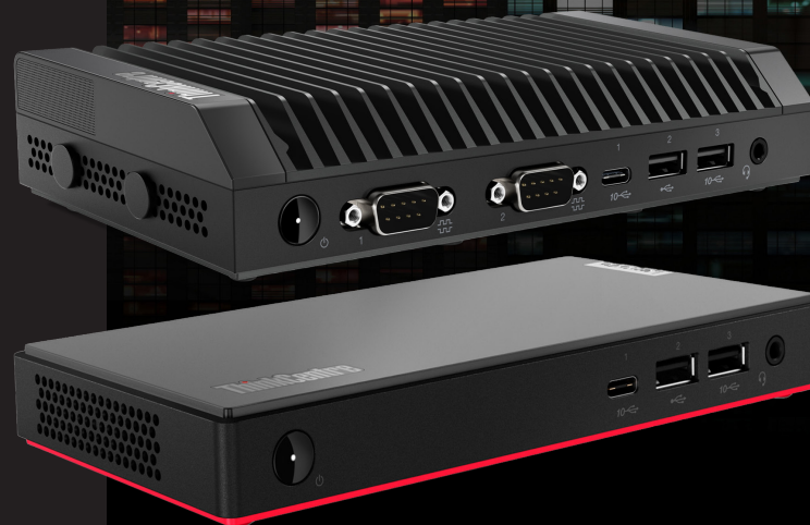
ThinkCentre M75n IoT Thin Client

These devices are not only ideal for shrinking workspaces and employees who are in the office one day and working from home the next, they are also an IT administrator's dream come true. They have the performance needed to quickly and easily access software and data in the cloud. Plus, software patches, security updates, and more can be activated for all users at once, which speeds up deployment and improves efficiency. When you pair Lenovo's proven security and durability with the affordability factor of a thin client device, the result is a portable, affordable Nano PC that still offers the dependable data and device protection businesses need.