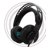
Legion H300 Stereo Gaming Headset