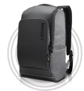
Lenovo Legion 15.6" Recon Gaming Backpack

* Example of Lenovo Legion catalogue naming convention