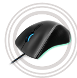
Lenovo Legion M500 RGB Gaming Mouse