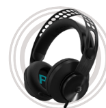
Legion H300 Stereo Gaming Headset