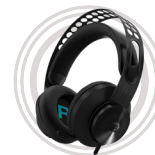
Lenovo Legion H300 Stereo Gaming Headset