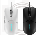
Lenovo Legion M300s RGB Gaming Mouse