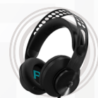
Lenovo Legion H300 Stereo Gaming Headset