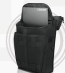
Lenovo Legion Active Gaming Backpack