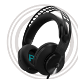
Lenovo Legion H300 Stereo Gaming Headset