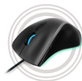
Lenovo Legion M500 RGB Gaming Mouse