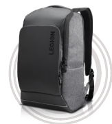
Lenovo Legion 15.6" Recon Gaming Backpack