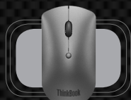
Lenovo Bluetooth® Silent Mouse