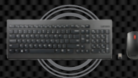
Lenovo 510 Wireless Combo Keyboard & Mouse

* Example of Lenovo IdeaCentre AIO catalogue naming convention