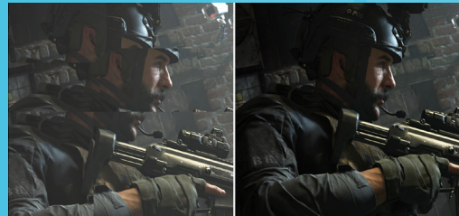
No AMD Radeon FreeSync™ AMD Radeon FreeSync™ On

Enjoy every second of your game thanks to the amazing 1500R curvature on this 31.5-inch monitor. The NearEdgeless, 2560 x 1440 display offers clear visuals and remarkable picture quality—perfect for gamers.