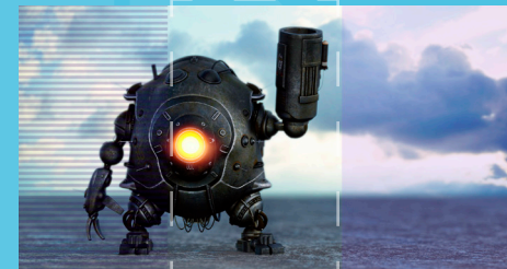
Flicker Eye Care Technology Blue Light Filter Off

Enjoy tear-free and stutter-free gameplay with AMD Radeon FreeSync™** technology. Its 1ms response time with MPRT** eliminates streaking and ghosting, while the 144 Hz refresh rate reduces motion blur, allowing you to play your favorite games without any distractions.