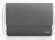
Lenovo Ultra Slim Sleeve

* Example of Lenovo IdeaPad catalogue naming convention