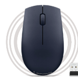
Lenovo 520 Wireless Mouse