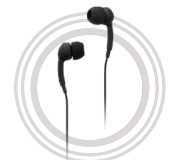
Lenovo 100 In-Ear Headphone