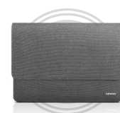
Lenovo Ultra Slim Sleeve