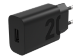
Lenovo 20W USB-A Wall Charger