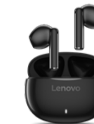
Lenovo E310 True Wireless Stereo Earbuds (Black)