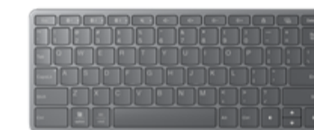
Lenovo Multi-Device Wireless Keyboard