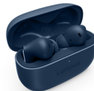
Lenovo TWS YOGA PC Edition - Cosmic Blue