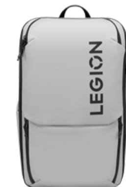
Lenovo Legion 17" Gaming Backpack GB800 (Light Gray)