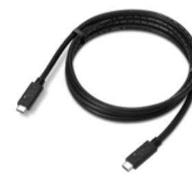
Lenovo USB 20Gbps USB-C to USB-C Cable 1.5m