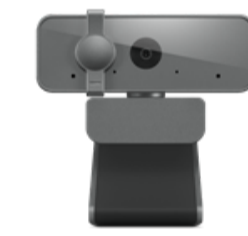
Lenovo Select FHD Webcam Gen2