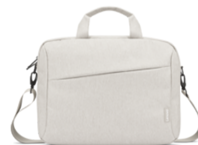
Lenovo 16" Laptop Topload T210 Beige (ECO)