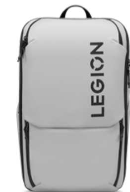
Lenovo Legion 17" Gaming Backpack GB800 (Light Gray)