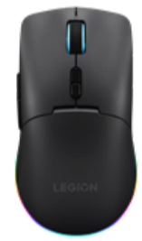
Lenovo Legion M220 Wireless RGB Gaming Mouse (Eclipse Black)