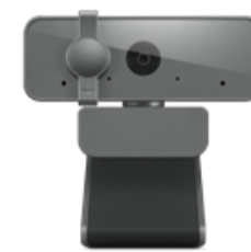
Lenovo Select FHD Webcam Gen2