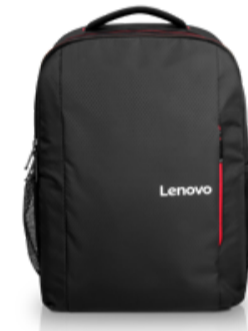
Lenovo 16" Laptop Everyday Backpack B510