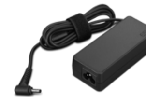
Lenovo 65W AC Adapter (Round Tip)-EU1/Arabia/Indonesia/ROK