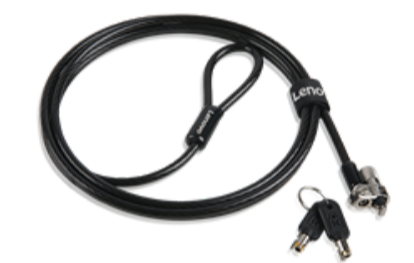
Kensington MicroSaver DS 2.0 Cable Lock from Lenovo