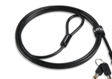
Kensington MicroSaver DS 2.0 Cable Lock from Lenovo