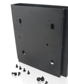
ThinkCentre Tiny Sandwich Kit II