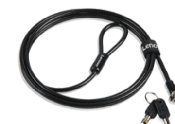
Kensington MicroSaver DS 2.0 Cable Lock from Lenovo