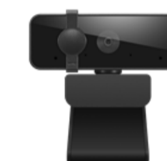
Lenovo Essential FHD Webcam Gen2