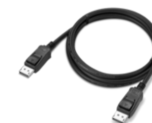
Lenovo DisplayPort to DisplayPort 1.4 cable 1.8m