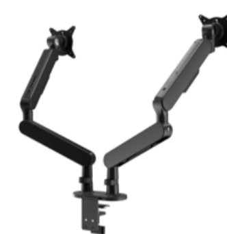
Hexergo Dual Monitor Arm Black CTS203