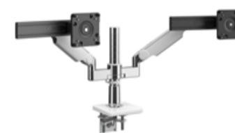
Humanscale Arm for dual monitor configuration, polished aluminum with whit... 4ZE1U10767