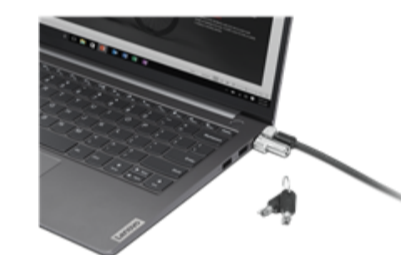
NanoSaver Cable Lock from Lenovo 4XE1L51710