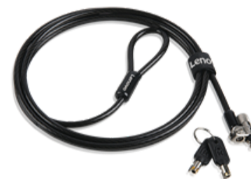
Kensington MicroSaver DS 2.0 Cable Lock from Lenovo