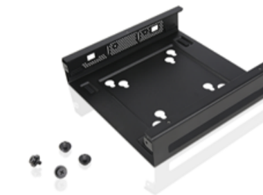
ThinkCentre Tiny VESA Mount II