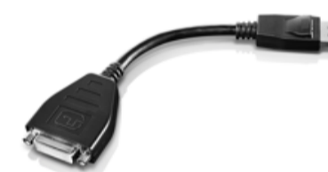
DisplayPort to Single-Link DVI-D (Digital) Monitor Adapter Cable II 4X91W44833