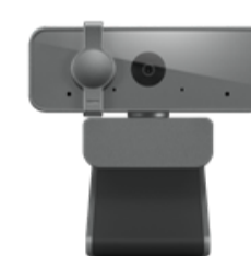
Lenovo Select FHD Webcam Gen2 GXC1S15023