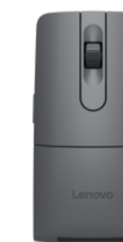
ThinkPad Bluetooth Presenter Mouse (Aura Edition) 4Y51T62792