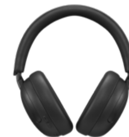
Lenovo Wireless Headphone 2000