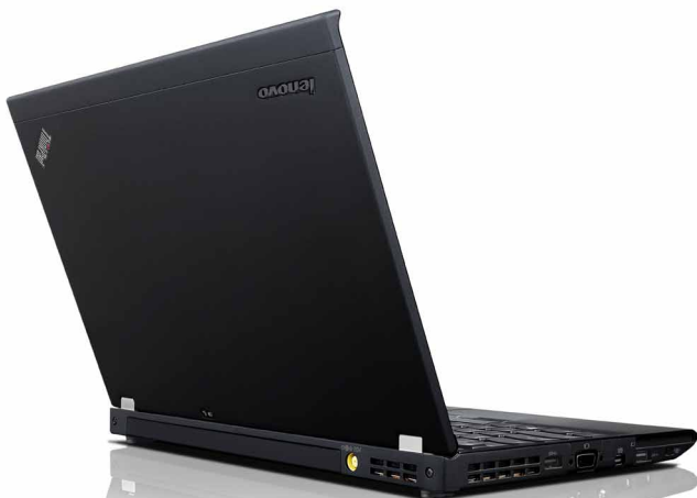
Lenovo ThinkPad X230