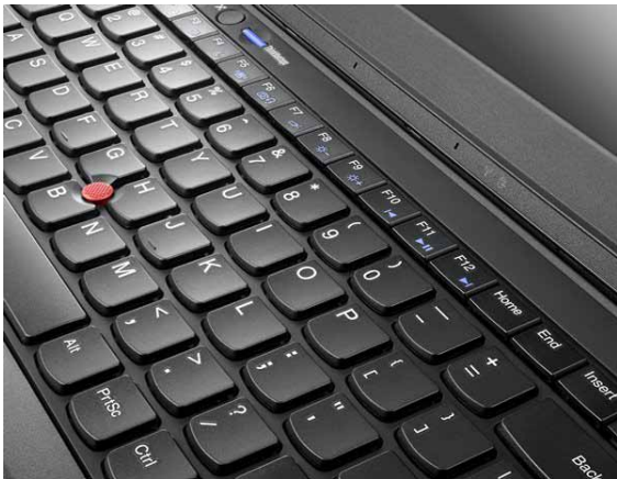
Lenovo ThinkPad X230