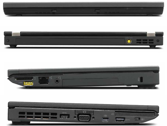
Lenovo ThinkPad X230