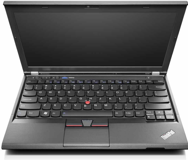
Lenovo® ThinkPad X230