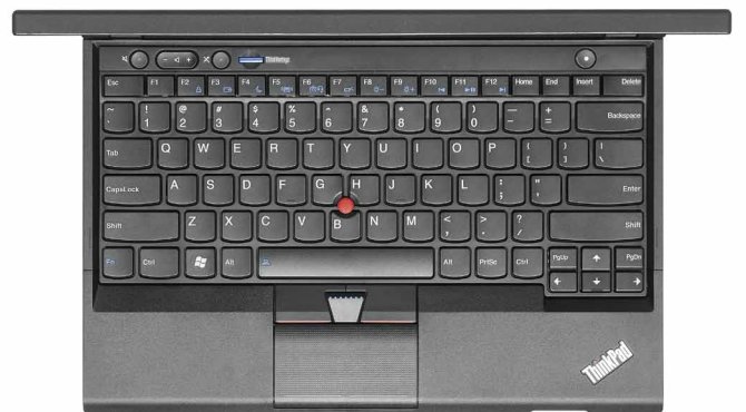
Lenovo ThinkPad X230