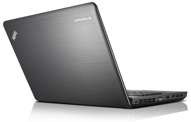
Lenovo ThinkPad Edge E530