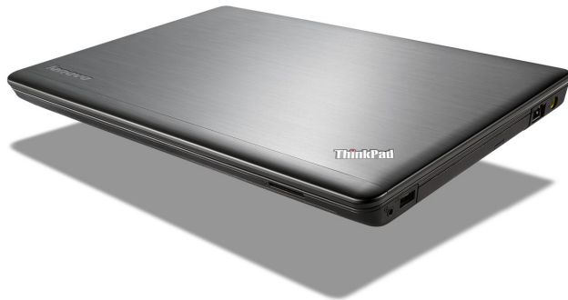
Lenovo® ThinkPad Edge E530