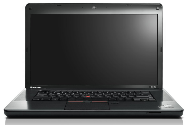
Lenovo ThinkPad Edge E530 without Numeric Keypad (Black aluminum)