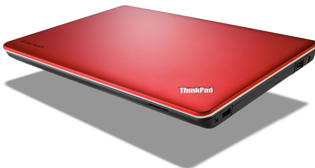
Lenovo ThinkPad Edge E530