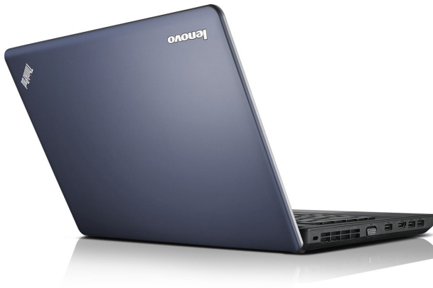
Lenovo ThinkPad Edge E530