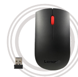
Lenovo 510 Wireless Mouse