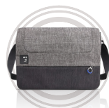
NAVA On-Trend Messenger