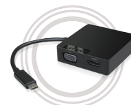
Lenovo USB-C Travel Hub