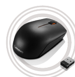
Lenovo 300 Wireless Compact Mouse