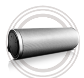
Lenovo 500 2.0 Bluetooth® Speaker