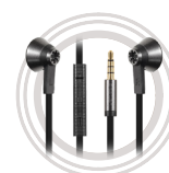
Lenovo 500 Extra Bass In-ear Headphones