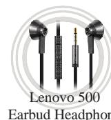
Lenovo 500 Earbud Headphone