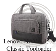
Lenovo N1205.6 Classic Toploader