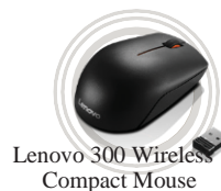
Lenovo 300 Wireless Compact Mouse